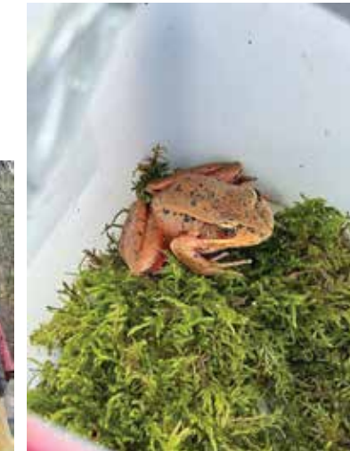
Endangered Species - Red Legged Frog